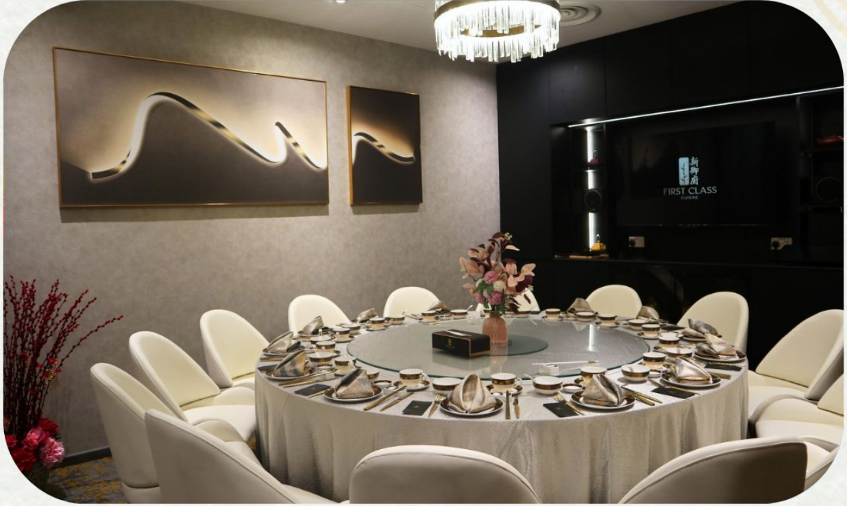
A Royal Dining Experience